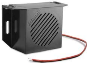
2 wire version

BC-01(H/Brake) - Single message - 2 wire - 90 Decibels