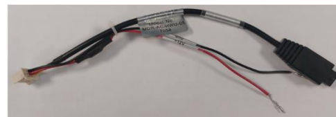
Below is a copy of the generic wiring diagram showing the location of the MDR-AC-HWU-01, connecting the MDR-641 to the BN360-300 (5800A). Clicking here , will link to the actual drawing on the website.

Click here , for the link to the drawing of the MDR-AC-HWU-01 connecting the MDR-641 to the BN360-200 (5200) on the website.