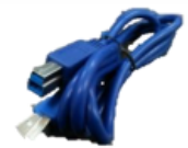
MDR-644 & MDR 500

When connecting the Mobile Caddy Unit (MCU), [aka Hard Disk Drive (HDD) or Solid State Drive (SSD)], ensure the correct Brigade USB cable is used and both ends of the USB-A are plugged into the PC. This needs connecting before opening the MDR-Dashboard 6.0 software. If it is not possible to connect both USB-A make sure it is the main, thicker cable is connected. The MCU Reader is required for the MDR-641.