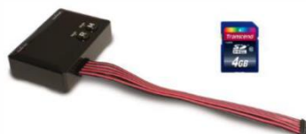
Calibration Tool – BN360-CT-01

Note - The different USB firmwares do not affect the Calibration Tool or the Calibration Software.