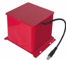
Fig.2 MDR Fireproof Box with 32GB SD Card

This Tech Tips refers to Section 7.5.4 Storage in the MDR Installation Guide.