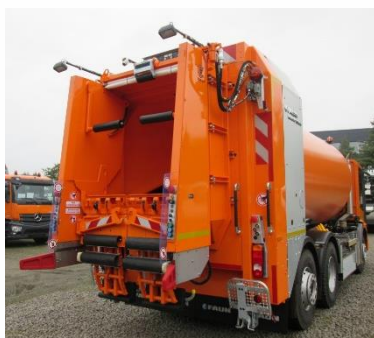
Example of ancillary equipment probably too large for ELM to ignore.

To activate ELM once the system has been installed, switch the power off and on 5 times, leaving 6 seconds between cycles. This will enable the system to recognise the ancillary equipment as part of the vehicle rather than an object to be detected.